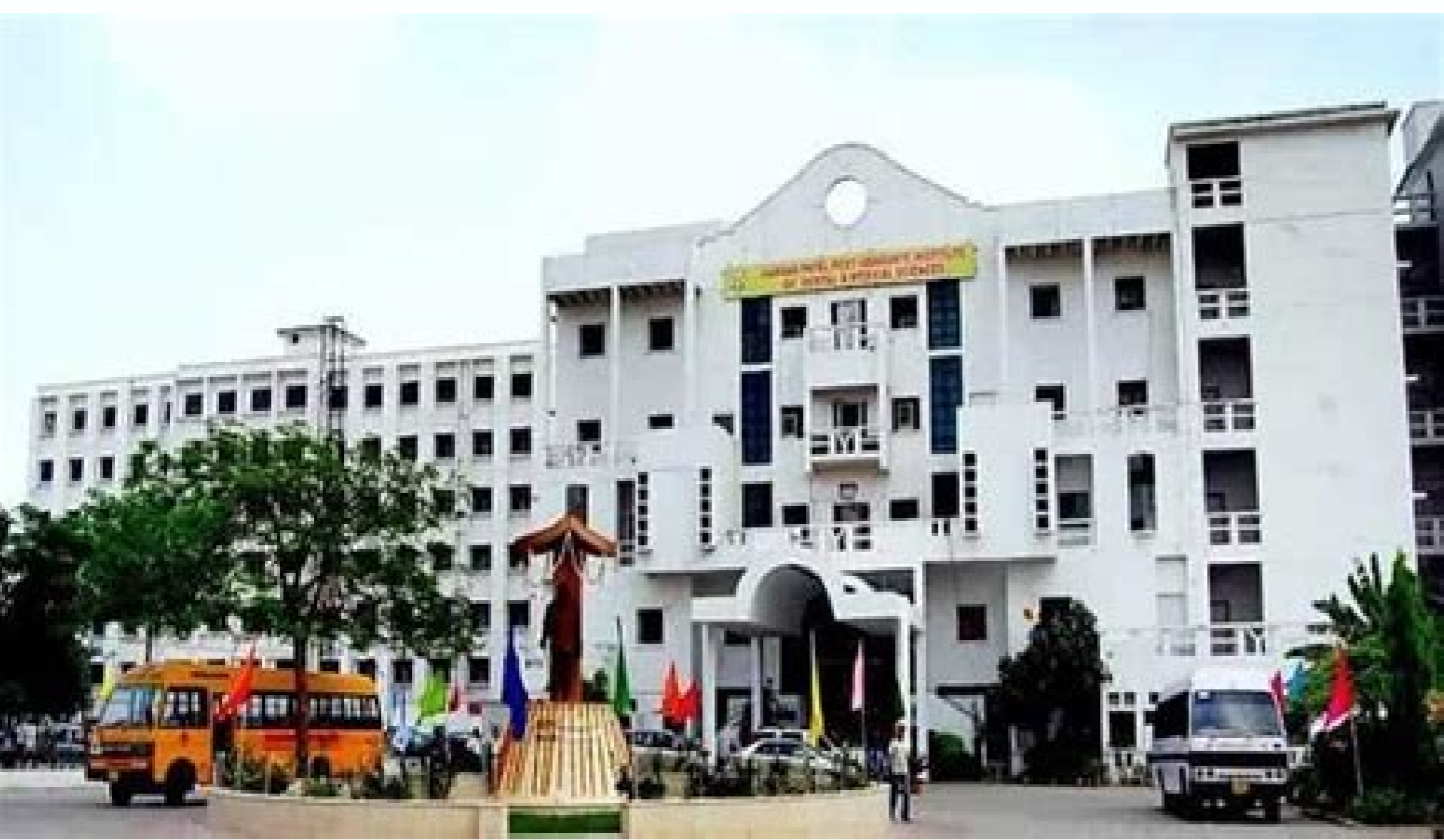
Ma private form avadh university. Avadh university ma private form last date. Avadh university private form 2020. Avadh university private form 2021. Avadh university private form 2022.